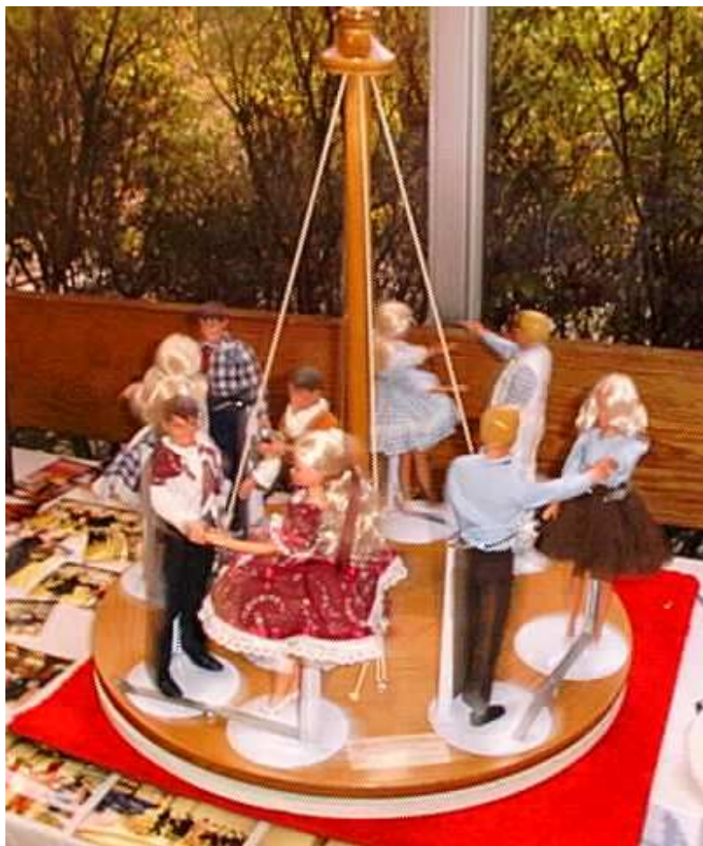
Original Carousel 1998 Mini-Fest